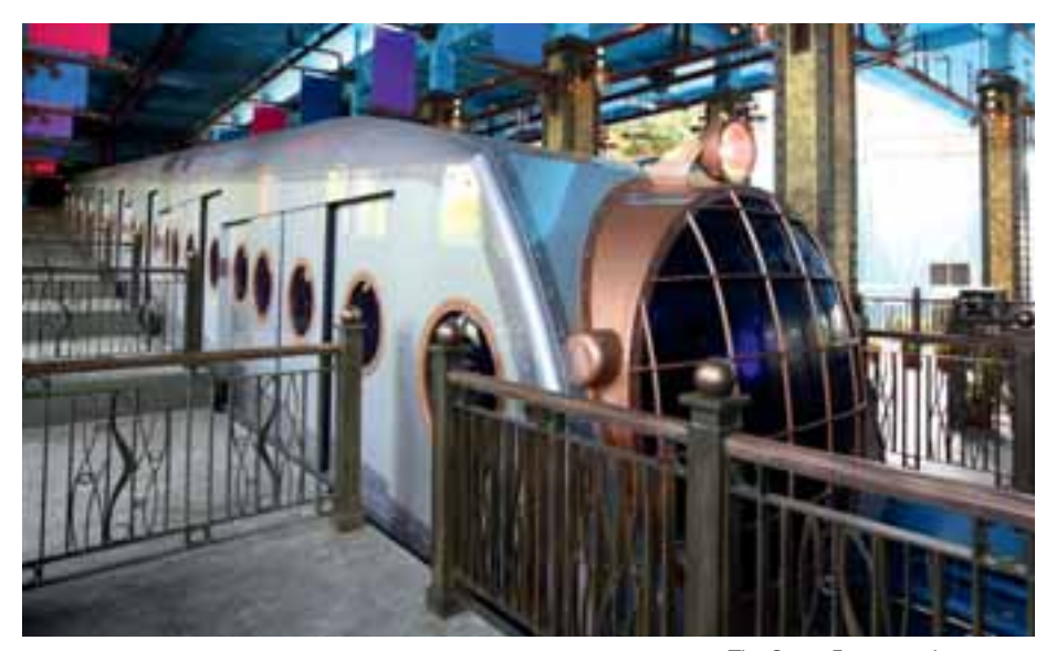
The Ocean Express in the station